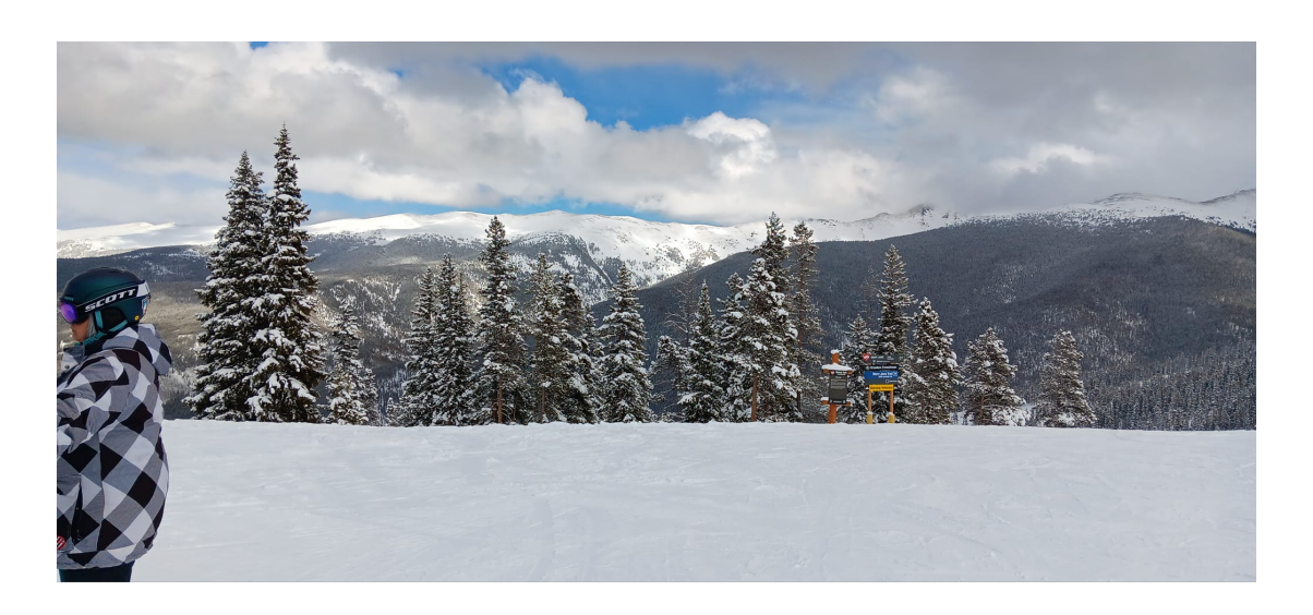
View of Winter Park, Colorado.