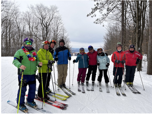
Top of the hill at Greek Peak.