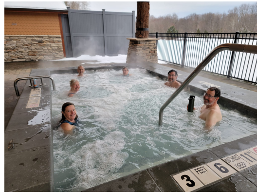
There's plenty of room in the hot tub at Tailwater.