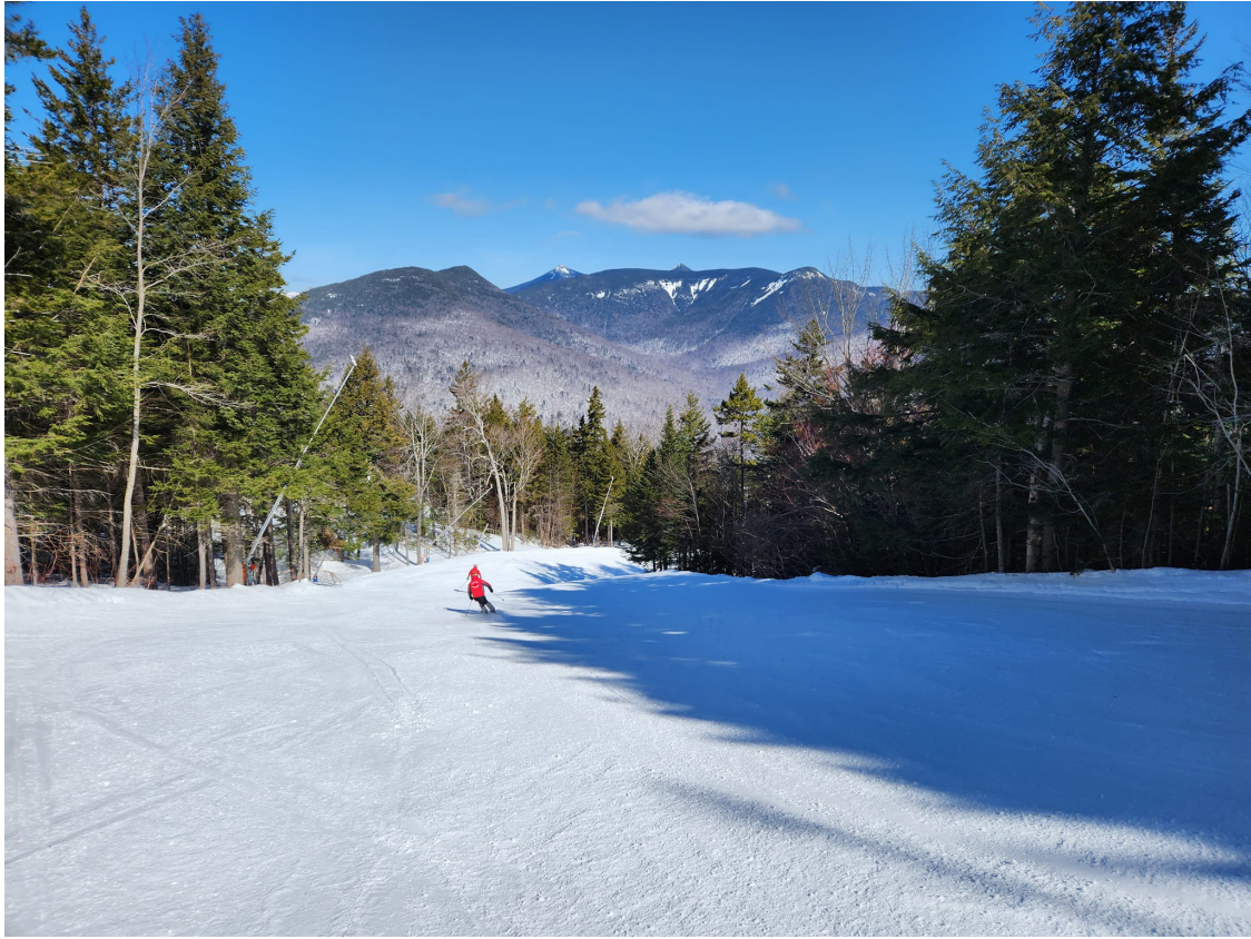
Skiing Loon Mtn. during the New Hampshire ski trip, March 19-24, 2023.