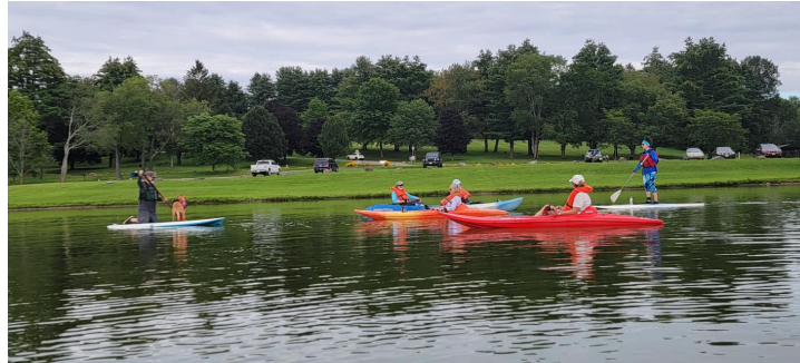
Photo: Piper, the dog on the paddleboard, enjoyed it too. followed by ice cream at The Scoop in WP.