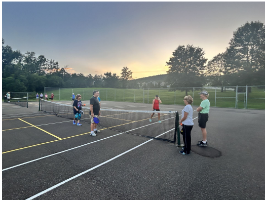
Players were treated to clear skies followed by a beautiful sunset.