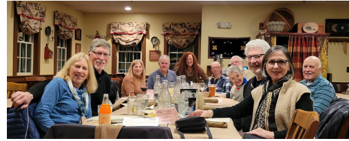
Dinner on Loon trip.