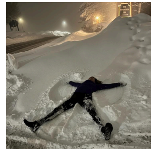
Making a snow angel.