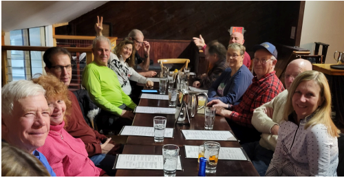
Dinner on Killington trip.