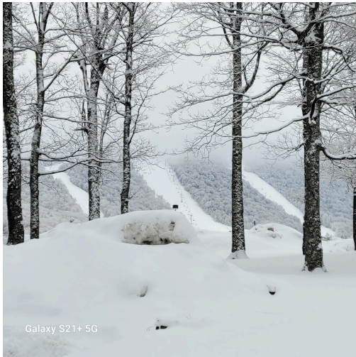
View of Killington Mtn. from Cascades Lodge